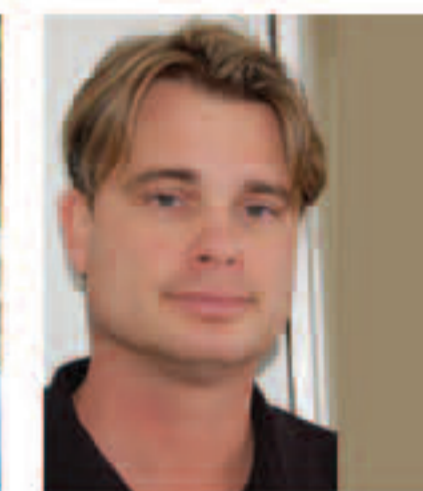
Van Franke Franke Architects, Kensington 301-530-5887