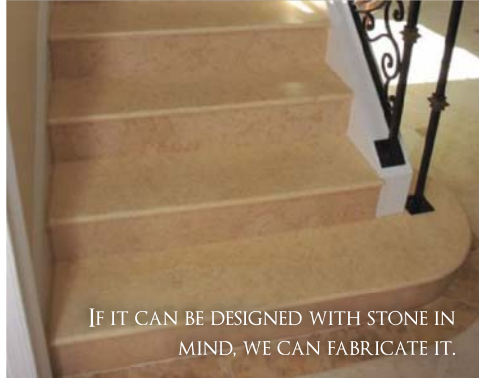
IF IT CAN BE DESIGNED WITH STONE IN MIND, WE CAN FABRICATE IT.