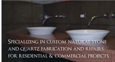
SPECIALIZING IN CUSTOM NATURAL STONE AND QUARTZ FABRICATION AND REPAIRS FOR RESIDENTIAL & COMMERCIAL PROJECTS.